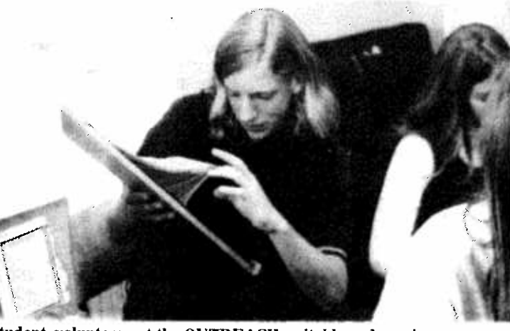
Student volunteers at the OUTREACH switchboard receive co-op credit while serving the community.

education, environment, food for which they may receive co-op education credit. For example, Canada students started an information and crisis switchboard in Redwood City. Students working at Hillcrest Juvenile Hall had created a salaried position for one person. "Most students do think in terms of finding a job that is already there and filling it" he said, "But it is entirely possible to create jobs by learning skills that are in demand, or will be in the future."