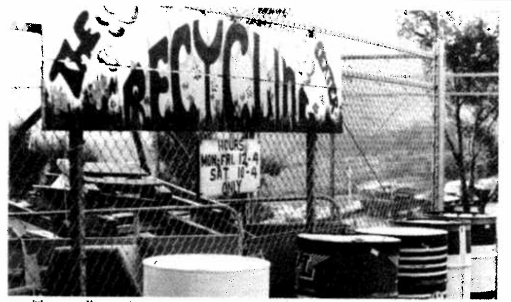
The recycling center on campus is outlined by barrels fitted with glass and other recyclables that are brought in by students.